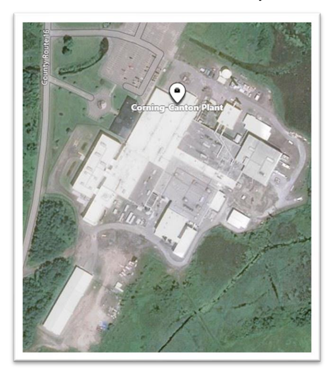
Corning Canton Plant in the Town of DeKalb

Corning has excellent global recognition, demonstrating the County's ability to attract and support top tier employers. Higher technology jobs like the ones at Corning also provide diversification in the workforce and employment opportunities for local college graduates.