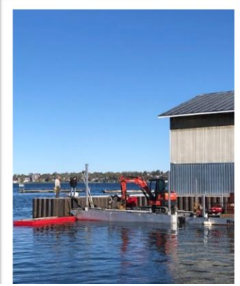
Wrights Sporting Goods and Marine, Morristown, pier work

allocation of funds from the Community Development and Environmental Improvement Program ("CDEIP") and the IDA is assisting local awardees as they complete their repair projects.