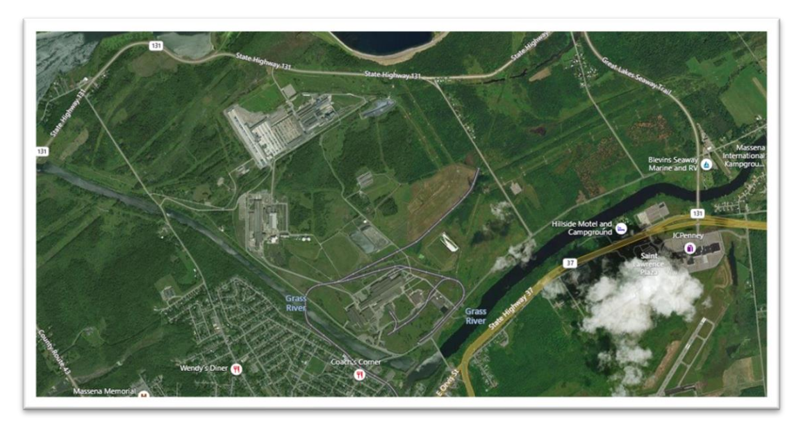
Arconic Property for Potential Development in Massena

■ The IDA and Arconic continue to work on plans for the conceptual development of a business park on excess Arconic property in Massena. Funds for this effort have been provided, in part, by a $90,000 Consolidated Funding Application grant from Empire State Development. The goal is to create a comprehensive, cohesive view for developing the property as a mixed-use industrial, technology, commercial and agri-business campus. The feasibility study of the Arconic property in Massena will provide the information and data needed to prepare the sites for future development activities.