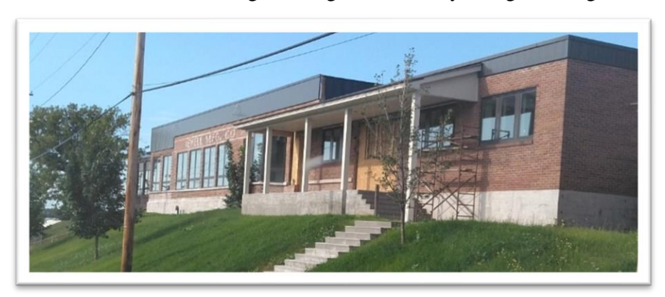
The former Newell Building in Ogdensburg

The IDA secured $200,000 in 50/50 in grant/loan funds from the Development Authority of the North Country and $500,000 in grant funds from the Northern Border Regional Commission to continue with the rehabilitation of the building. As these funding sources are reimbursement-based, the St. Lawrence County IDA – Civic Development Corporation authorized a loan in amount of up to $500,000 to the PDC to assist with the up-front financing. The second phase of the rehabilitation project, expected to cost approximately $1 million, is near completion. This phase included reinstalling water, sewer, electrical, gas, and heating systems, as well as a new building entrance, corridors, office space, and restrooms.