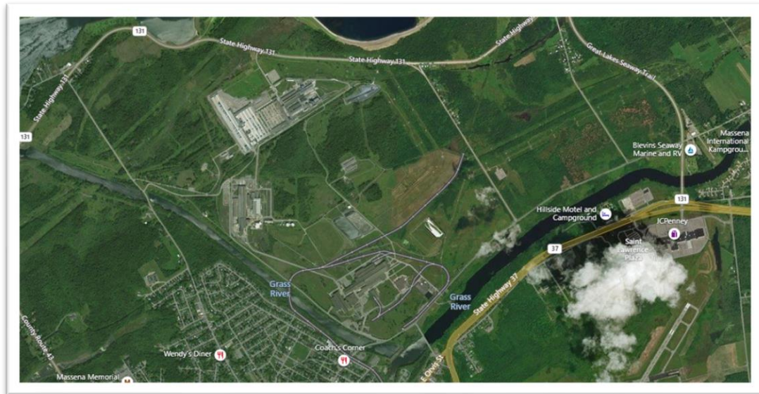
Arconic Property for Potential Development in Massena