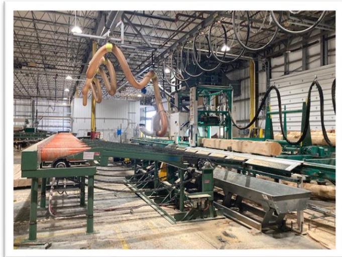
North American Forest Group Sawmill production activity

The funds will help Curran Renewable and its related entities, Seaway Timber Harvesting and North American Forest Group, in the ongoing effort to start sawmill operations at the former ACCO facility in the Town of Oswegatchie.