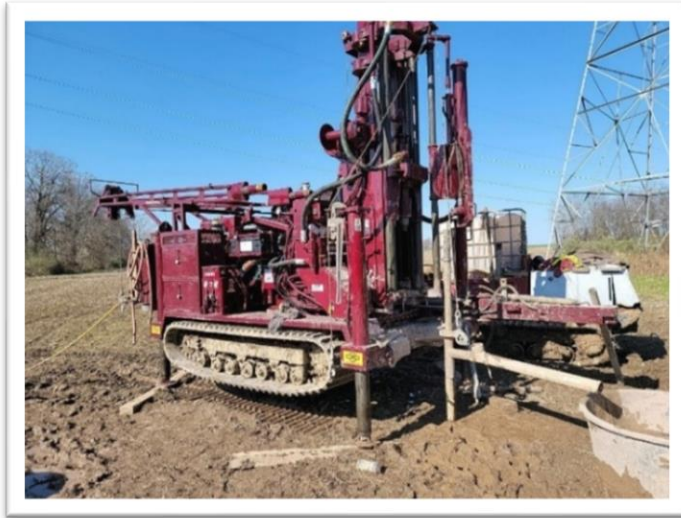
ATL’s new CM E-55LC/300 rubber track drill

The purchase of the new drilling rig will create two jobs at ATL’s drilling division, which is headquartered in Canton and currently employs over 20 workers.