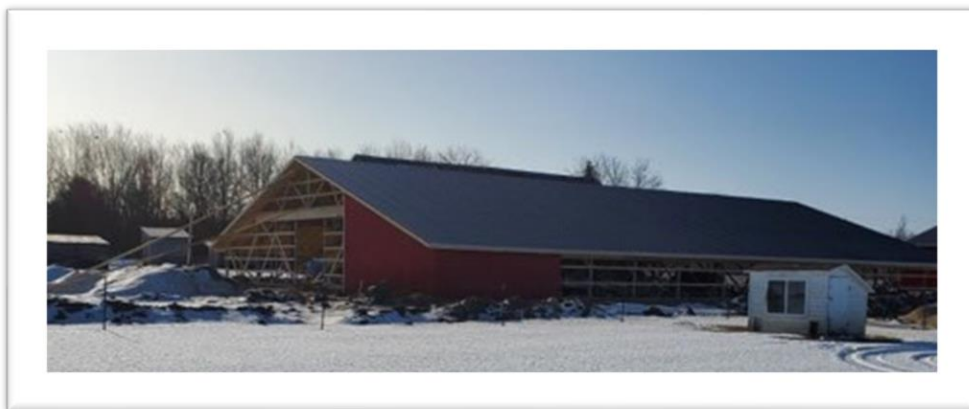
M&M Eggs facility, 291 Small Road, Town of Brasher

The TBMRLF was established by the Town of Brasher using Tribal Compat money set aside to provide loans for the start-up or expansion of microenterprise businesses located in the Town of Brasher, doing business in, and/or providing services to the residents in the Town of Brasher. The funding is expected to help bring the business to a whole new level of production. Winter production needs will be met utilizing a warm barn. The eggs will be distributed to several restaurants around the County as part of a direct sale and help increase the farm-to-table options and present more organic food opportunities which has grown in popularity in recent years.