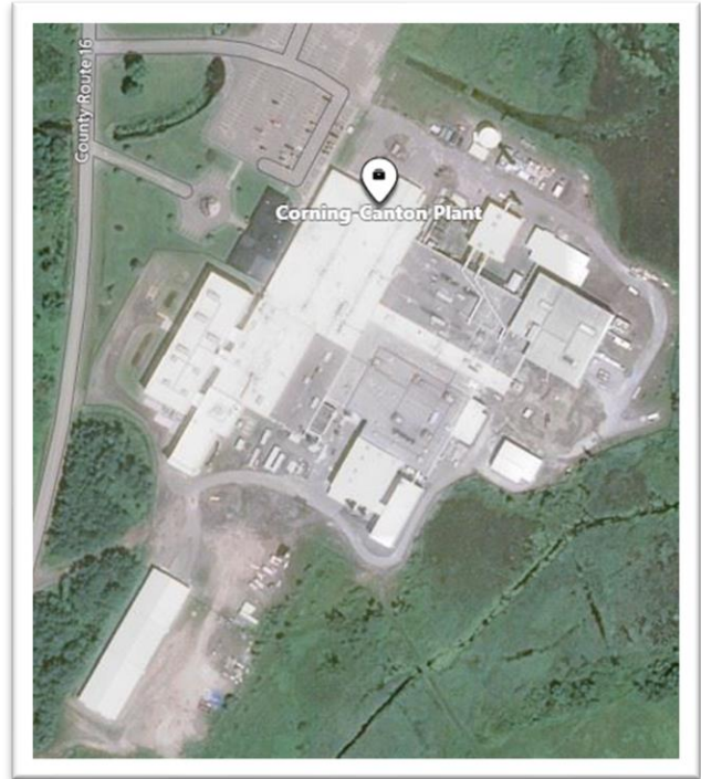
Corning Canton Plant in the Town of DeKalb

Corning has excellent global recognition, demonstrating the County's ability to attract and support top tier employers. Higher technology jobs like the ones at Corning also provide diversification in the workforce and employment opportunities for local college graduates.