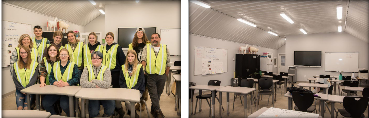
2023-2024 Ag Studies Academy Class and the upgraded Ag Studies Academy Classroom

The Cornell Cooperative Extension of St. Lawrence County was provided a $25,000 loan from the St. Lawrence County IDA – Civic Development Corporation to assist with the completion of upgrades to the Agricultural Studies Academy classroom and will leverage the ARPA funds also awarded for the project that the IDA is administering on behalf of St. Lawrence County.