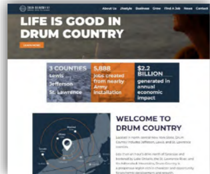
Drum Country Website

Representatives from Fort Drum attended our Business Mixer event in April and discussed the process of transitioning soldiers into the regional workforce. This relationship with Fort Drum was developed as part of this initiative.