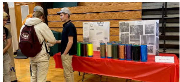
AmTech Yarns in Massena talks with local Students

This opportunity served to inform students about the local employers in the area and the types of career opportunities available to them.