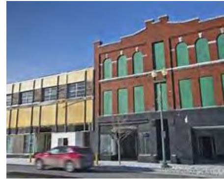
The former Massena School of Business

An agreement was later signed with Aubertine and Currier Architects, Engineers and Land Surveyors PLLC for Architecture and Engineering Design Services. which will preserve the building’s historic façade and improve access to the downtown Main Street business corridor.