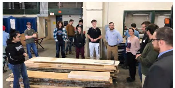
Spotlight on Resources BOCES Tech Center Tour

Many employers who attended the Business Connections events expressed interest in connecting with BOCES students.