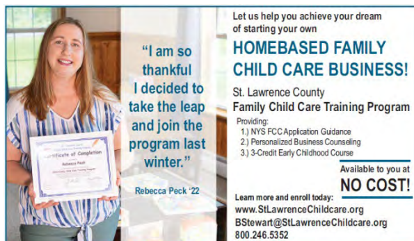
One of the program participants is featured in the picture above, at her home-based business in Colton, promoting the St. Lawrence County Childcare Training Program.

Since the three-year program launched in 2022, 152 new childcare slots have been created and 15 new providers were supported by the St. Lawrence County Family Child Care Training Program (“FCCTP”). The first half of this year, the FCCTP committee opted to open the program to current providers to help strengthen their business to ensure their success and longevity. Ten current providers (with 96 existing childcare slots) took advantage of the program offerings, which includes an Early Childhood Development course, and the Small Business Development classes offered by SUNY Canton. A total of 25 licensed providers and a total of 248 childcare slots from communities all over the county have benefited from the FCCTP. These are outstanding results which help with early childhood development, working families and small business development in St. Lawrence County.