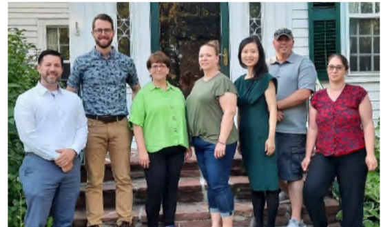
STL-CEL Class of 2024

This is the 4th class to complete the course with close to 40 small business leaders in St. Lawrence County that have now completed the program.